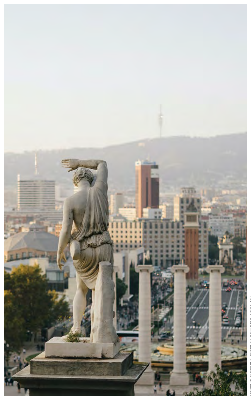
MONTJUIC, BARCELONA.