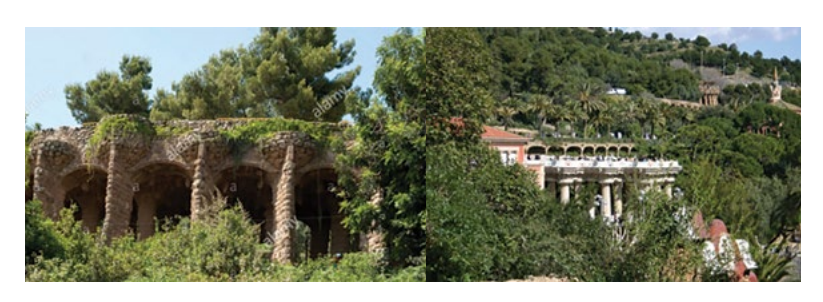
Tour 5: Turó de la Rovira. War and post-war Barcelona

Anti-aircraft structures to defend the Republic in the Spanish Civil War (1936-39) and post-war shanties, inhabited until the 1980s, constitute a heritage complex about cities in crisis, which goes from a global perspective to Barcelona.