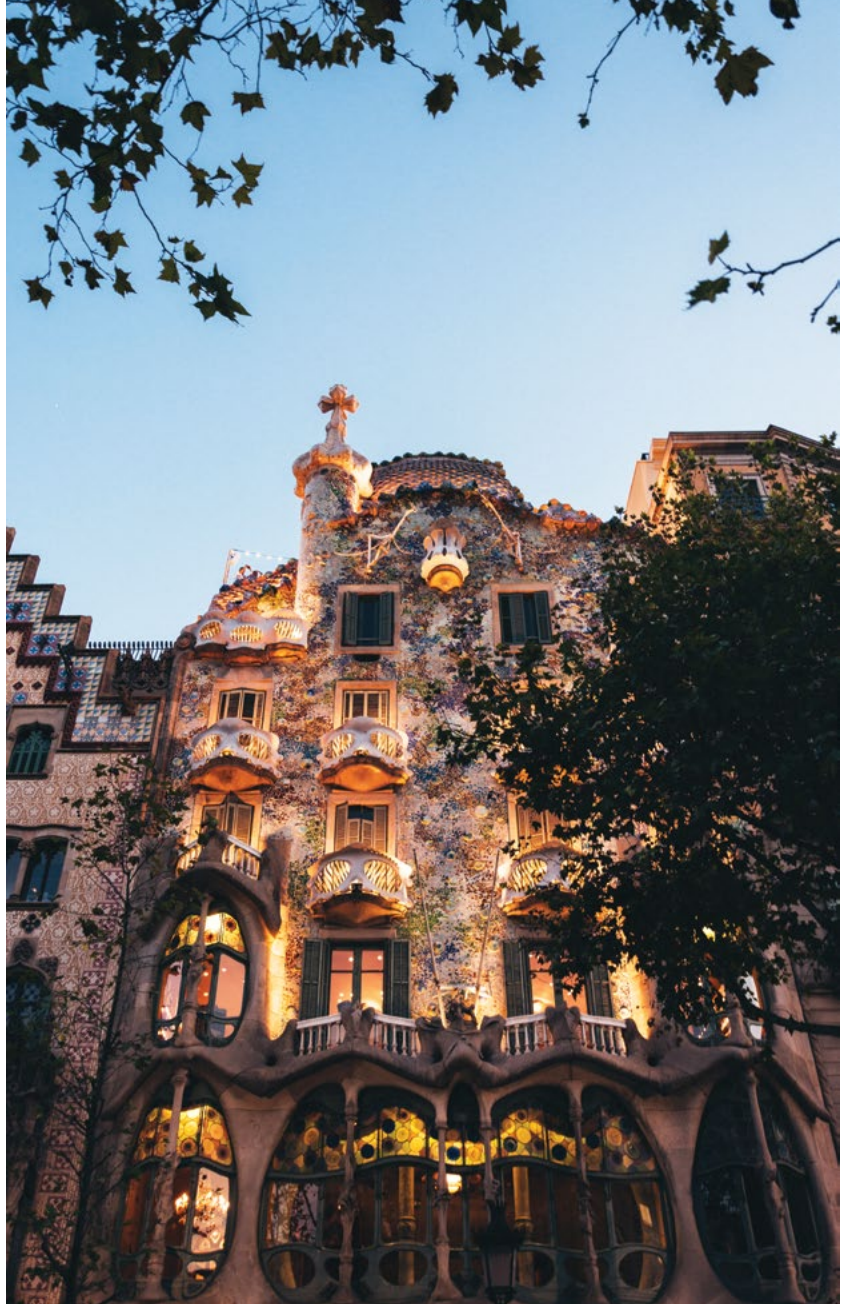
CASA BATLLÓ, PASSEIG DE GRÀCIA, BARCELONA.